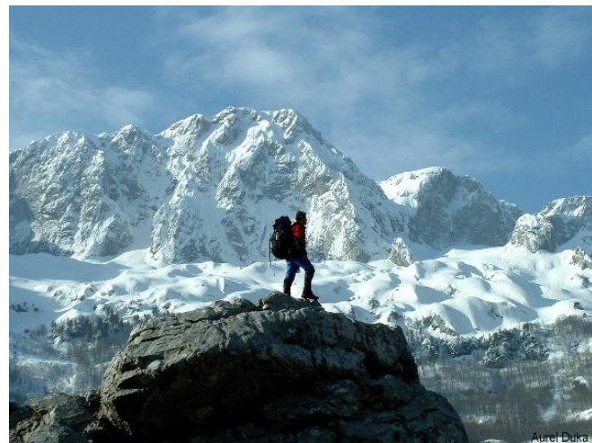
Mt. Blanc in the Alps