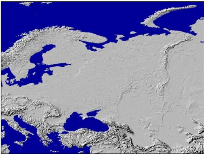
It divides the European and Asian sections of Russia.